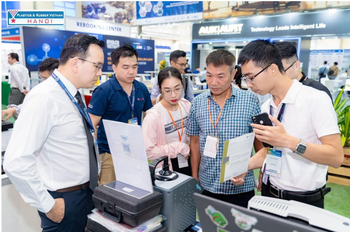
The exhibition brings many opportunities for cooperation between Vietnamese and international businesses (Photo: Plastics & Rubber Vietnam, Hanoi 2023)