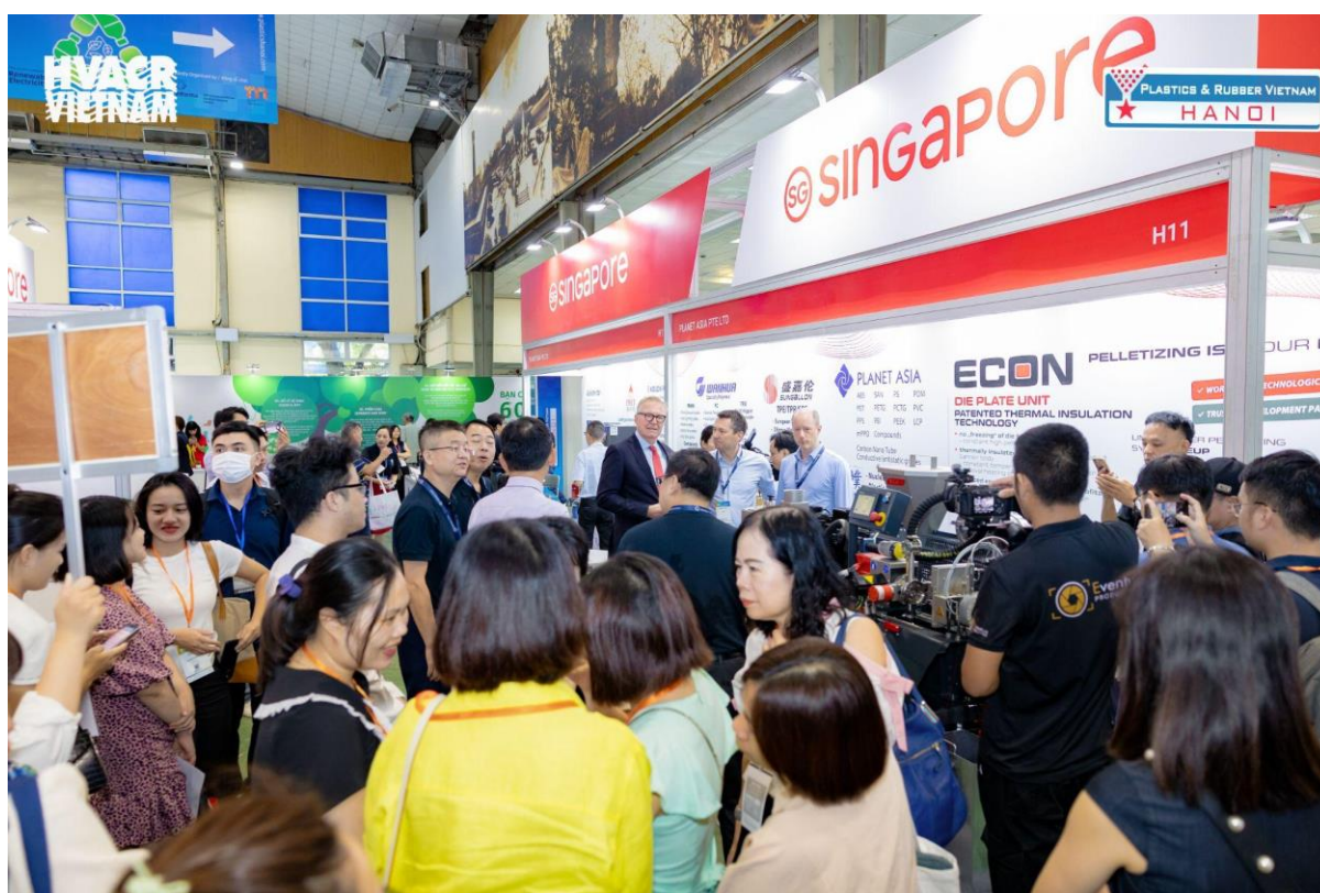
Plastics & Rubber Vietnam is expected to attract 100+ exhibitors in 2024

Accompanying the plastics and rubber industry in Vietnam for over a decade, the 11th edition of Plastics & Rubber Vietnam exhibition will take place from March 13th -15th, 2024 at the Saigon Exhibition and Convention Center (SECC), District 7, HCMC. The event is recognized as one of the prime opportunities for foreign key players in the plastics and rubber sectors to penetrate Vietnamese market, connect with local manufacturers who are actively seeking new technologies to innovate their production lines.