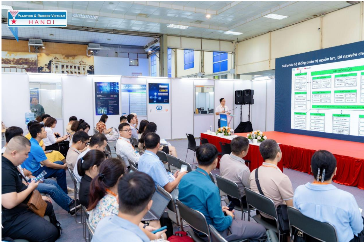
Plastics & Rubber Vietnam will host many valuable seminars

With a diverse range of showcased products, including machinery & equipment for the plastic and rubber industry; raw materials; additives; semi-finished products; technical components & reinforced plastics; general services; research & science, Plastics & Rubber Vietnam 2024 is an excellent trade forum for plastic manufacturers and processors. It provides an opportunity to present products, build brand image, explore new cooperation opportunities, and identify economic potentials in the Vietnamese market and region.